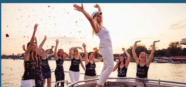
Party on board