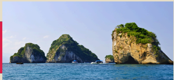
Los Arcos & Mismaloya