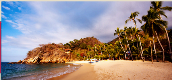
Majahuillas Beach & Beach Club