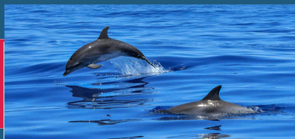
Dolphin, Sea Ray & Turtle watching