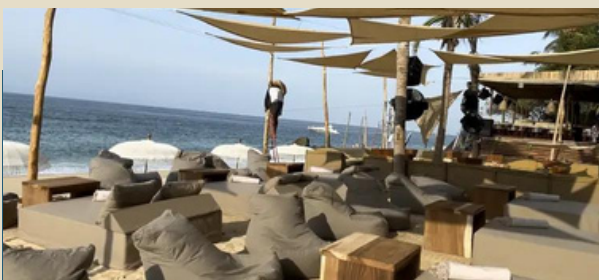
Beach Club Anima