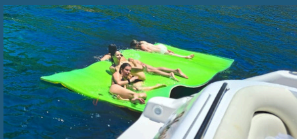
Paddle Board, Kayak, Lillypad...